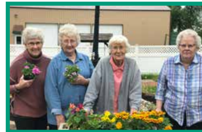
Evergreen Arbor ladies planting flowers.